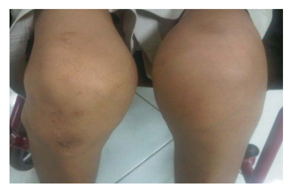
Figure 1. Physical examination revealed painful swelling of the left knee

knee and low Body Mass Index (BMI)16.5 kg/m<sup>2</sup>. Lung auscultation revealed signs of moderate rales. Examination of the left knee revealed a swollen warm knee, painful, restricted with reduced flexion ability and small amounts of effusion in the left knee joints (Figure 1).