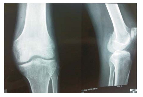
Figure 3. Anteroposterior and lateral radiographs of the knee showing is unremarkable other than a subtle soft-tissue swelling